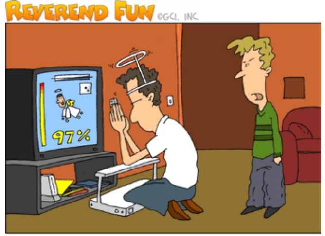
I'D TOTALLY GET PAST 'HEATHEN' ON WII PRAY IF I HAD AS MUCH SPARE TIME AS YOU DO

2008 is the year of hope! Find out more at www.hope08.com