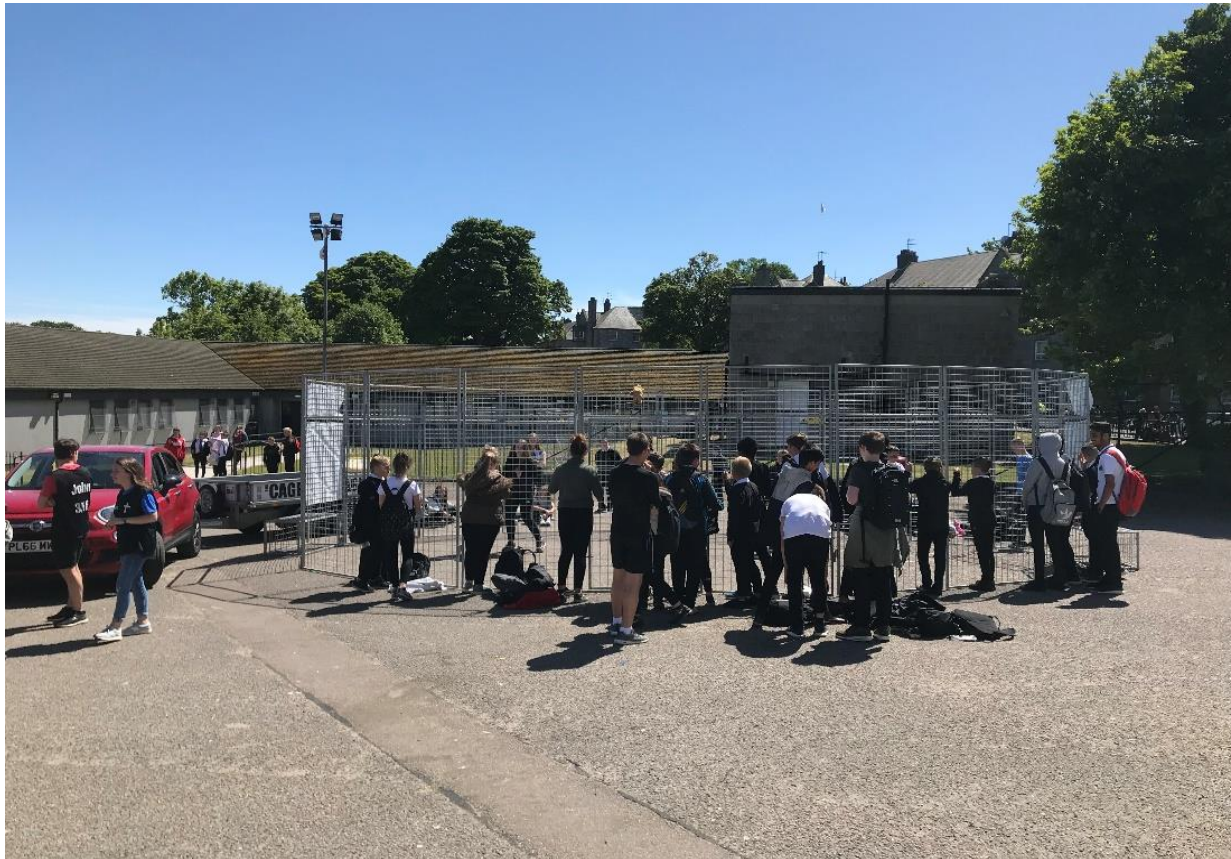
'The Cage' in action again at St Machar Academy