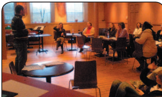
One of the training day sessions

We've another training day lined up for 15th September , be sure to put it in your diary!