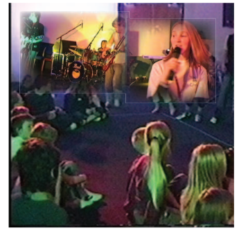
Scenes from Encounter

Finally, session 2008-9 will see the launch of Breathe Out . This initiative aims to share the experience of our team with others - if you'd like to see an event like Breathe run regularly in your community we'll work with local volunteers over the year to equip them with all they need to make it happen. Just give us a call or email breathe@nesyfc.org.uk for more information.