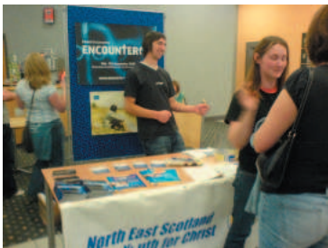
Did you see our stand at Encounter?

The most exciting thing for us is what we're imaginatively calling "The Project". It's seen so much confirmation over the past months; and we're itching to share it with everyone. Imagine that every single young person in North East Scotland (both in and out of Aberdeen City) is reached by a Christian worker. Every school and community has input from one of God's people, and not just in the sense of a traditional church or school assemblies; right at the heart of what young people are doing on a daily basis. That's what we'd love to see; there's already a number of places it is happening but there's much more to be done. "The Project" is a starting point which we aim to grow into fulfilling this vision.