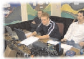
Our hard working tech team